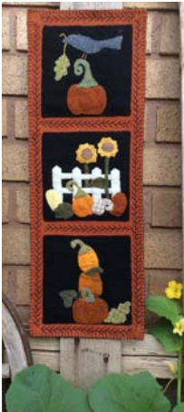
Gourds in the Garden